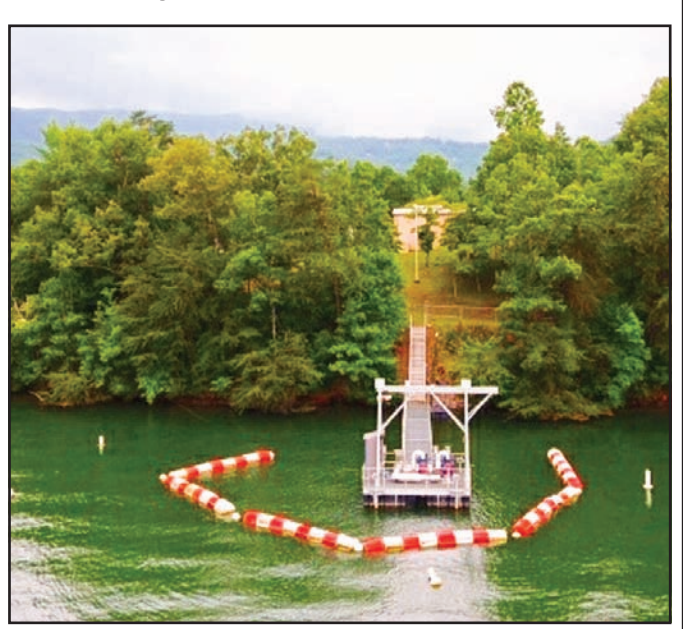
The Hiawassee Water Treatment Facility pulls water out of Lake Chatuge to treat for drinking and other uses.