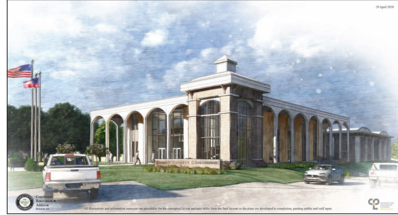
The preliminary concept for the new Towns County Courthouse is inspired by the old courthouse design, most notable in the new stair tower proposed at the corner of the existing building, according to architecture, engineering and planning firm CPL.